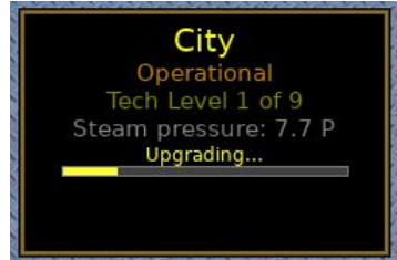
Figure 3: Upgrade in progress

When your city is selected, you'll see information about the upgrade in a window on the right-hand side. This is illustrated in Figure 3.