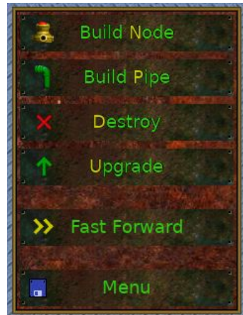
Figure 2: Game Controls

Next, select "Build Pipe", and click first on the City, and then click on the new Steam Maker. A red Pipe will appear between the two. The Pipe is red because it is not fully built: but building work will start immediately. Shortly, the Pipe will turn green: it has now been built, and is ready to